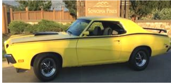
"Best Car Entry" - Walter Rendell, 1970 Cougar