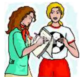
Sonoma Pines Reporters are on the prowl...