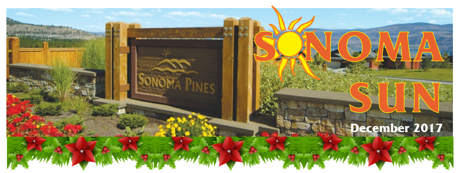
Thanks to the Social Committee for putting up the Christmas lights at the upper entrance.