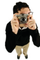
Photo Submissions for the Newsletter

All photos submitted for publication in the newsletter should contain some background information, or context about the photo and (if reasonable) the names of all people included in the photo. Thank You