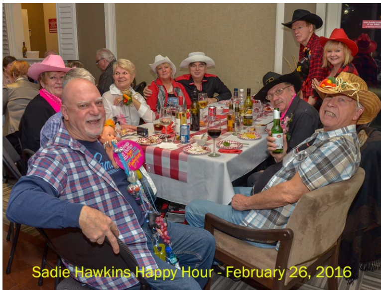
Sadie Hawkins Happy Hour - February 26, 2016

All photos submitted for publication in the newsletter should contain some background information, or context about the photo and (if reasonable) the names of all people included in the photo. Thank You