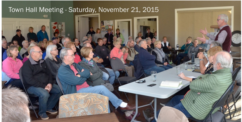
Town Hall Meeting - Saturday, November 21, 2015

There were many nodding heads when one homeowner expressed the opinion that they had purchased in the community because of the original plan and were not interested in expanding that plan if it were to add to additional fees. Others mentioned the importance of making sure current operational issues