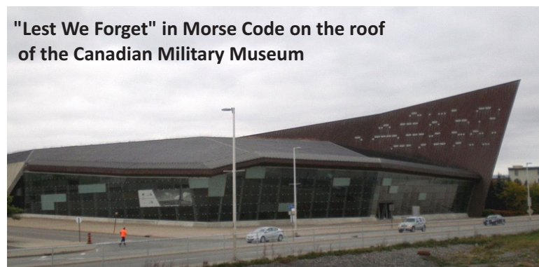
"Lest We Forget" in Morse Code on the roof of the Canadian Military Museum