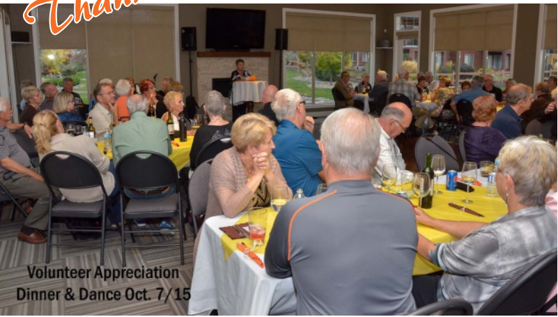
Volunteer Appreciation Dinner & Dance Oct. 7/15