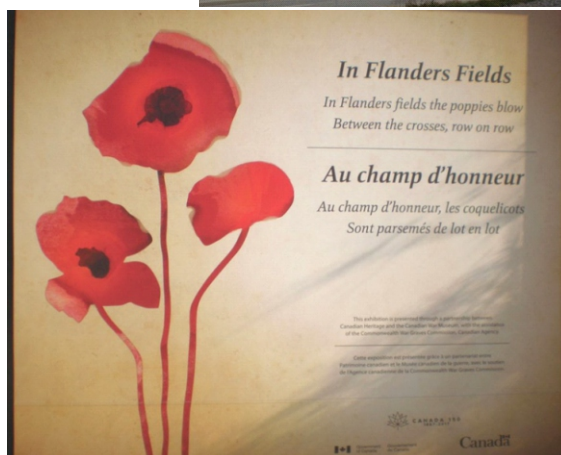
Art Exhibit on the street - poppies