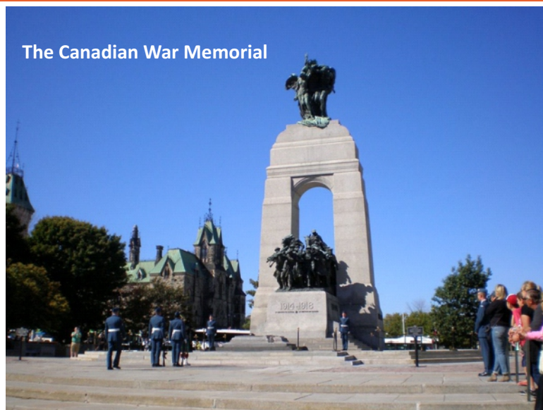
The Canadian War Memorial