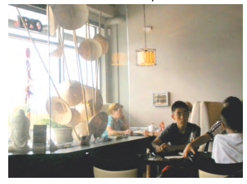
Check them out online: <a href="http://www.thaifusionrestaurant.ca/">http://www.thaifusionrestaurant.ca/</a> <a href="http://www.bamboochopsticks.ca/">http://www.bamboochopsticks.ca/</a>

We love both of them! The food is always good, freshly prepared with lots of fresh vegetables, and patrons are always asked for 'degree of spiciness preferred' and any food allergies or dislikes. For example, I eat neither green peppers nor bean sprouts and these restaurants are happy to comply with my requests. They won't break the bank either! :0) - M Trueman