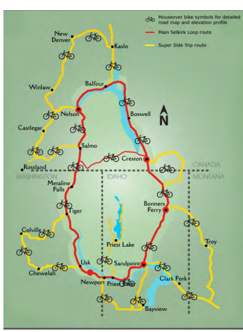
Some of the route George and Gail followed

Do you have any 2 wheel adventures to share with us? Please send them along with some photos to sonomapinesnews@gmail.com