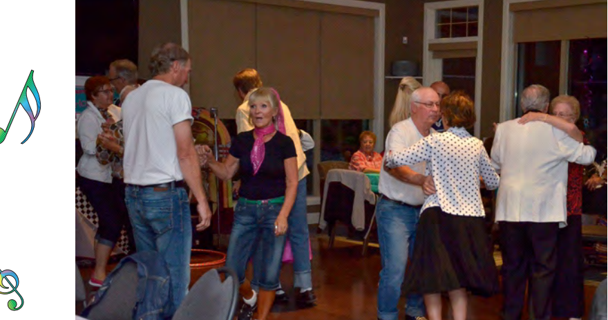
The Clubhouse was hoppin'

Thanks to the Social Committee for another excellent evening.