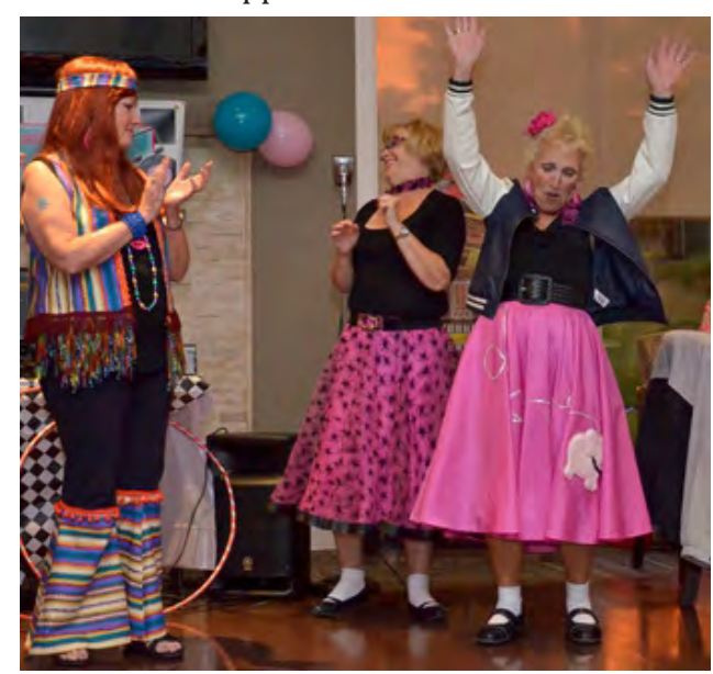
The 60's and the 50's were well represented