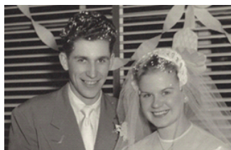
Newly Weds January 30, 1952