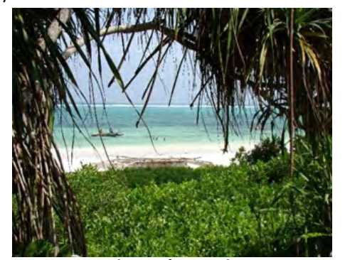
Morning wake-up view

have found our new "home" so close to home — it's beautiful here. We realize how fortunate we are, and to give back to show our appreciation for the good life we have, I have volunteered to assist our team to continue publishing the Sun Newsletter for all Sonoma Pines residents. I intend to share with you some experiences of different cultures and countries that we have travelled, lived in and experienced for the past 18 years.