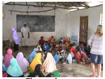
The madrassa a one room school

decades - or longer. And even though the children were of different ages, they all worked together, and behaved so well. When the teacher invited us into the one room school to distribute our gifts, we were flooded with the most beautiful smiles and thus had our hearts imprinted with those memories forever.