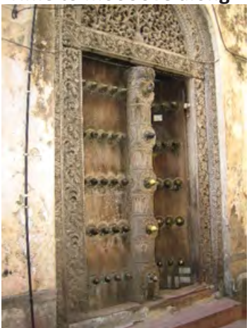
Wooden door in Stonetown