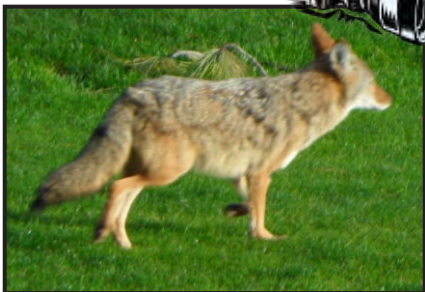
"Sonoma Pines Blockwatch Enforcer, on patrol".