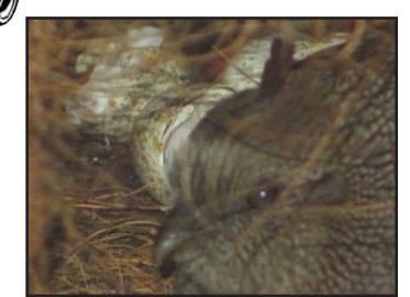
Mother guarding chicks